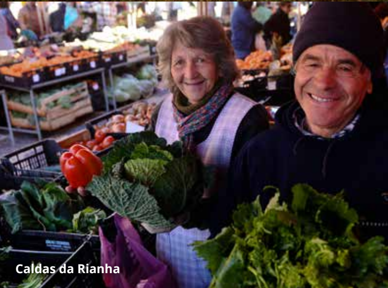
Caldas da Rianha