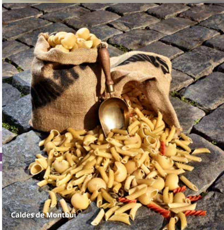
Caldes de Montbui